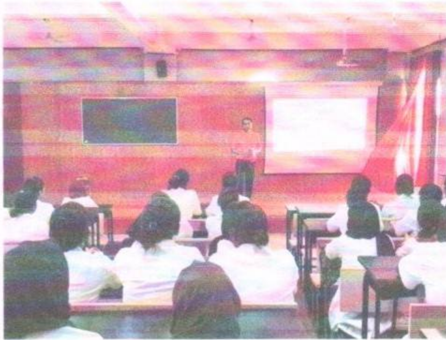
Attentive students in the class