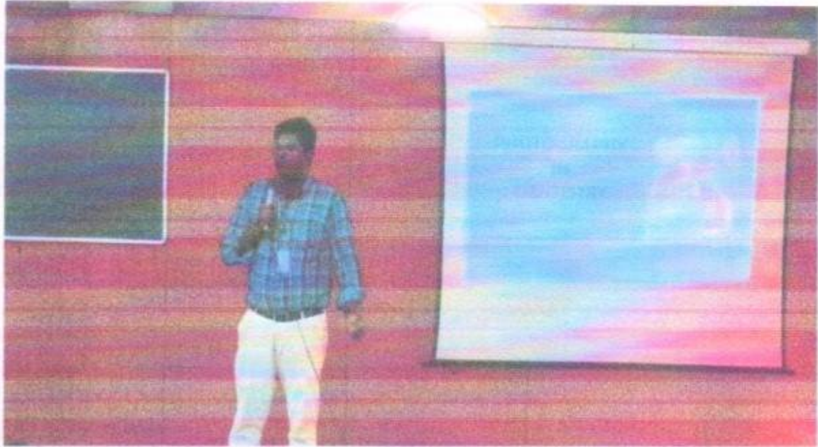
Students listening the lecture