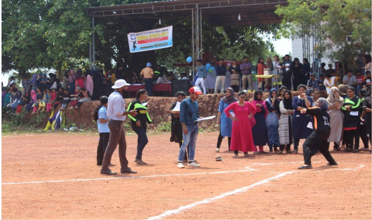
Shot put for girls

MAHE INSTITUTE OF DENTAL SCIENCES & HOSPITAL Chalakkara, P.O. Pallor, Mahe-673 310 U.T. of Puducherry. Ph : 0490 2337765